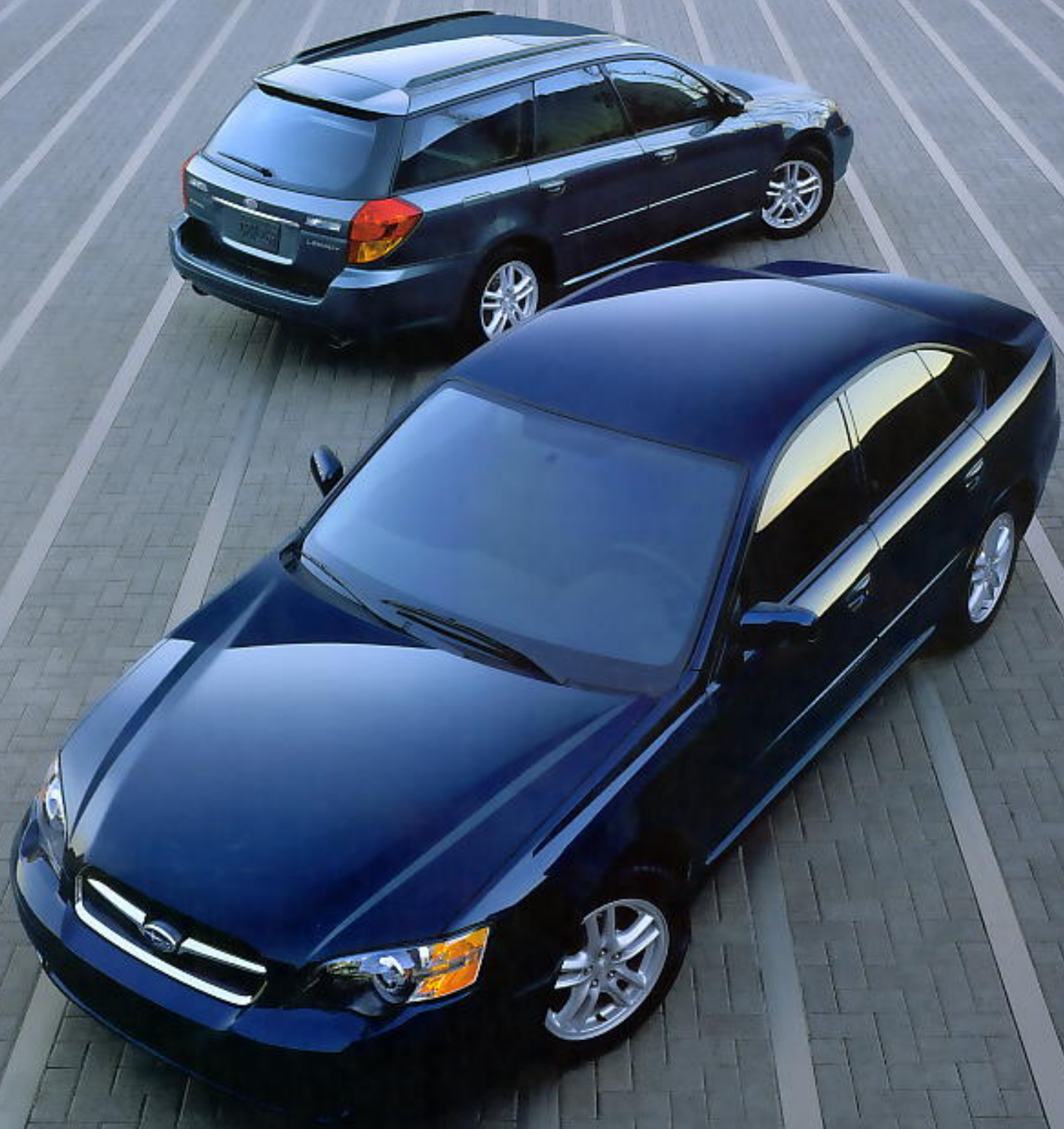
Legacy 2.5i Limited Wagon shown in Atlantic Blue Pearl and Legacy 2.5i Sedan shown in Regal Blue Pearl