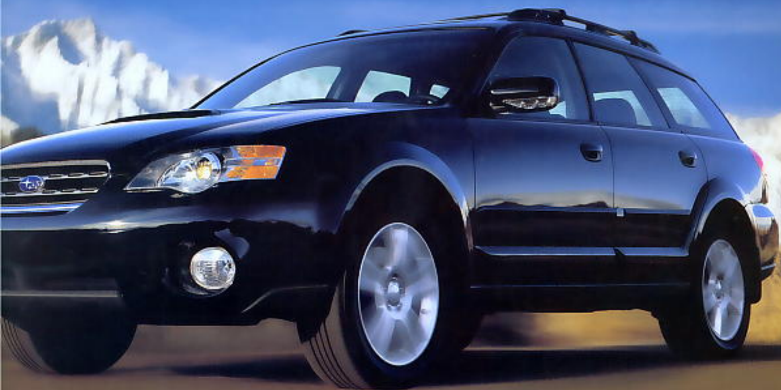
Outback 2.5 XT Limited Wagon shown in Obsidian Black Pearl