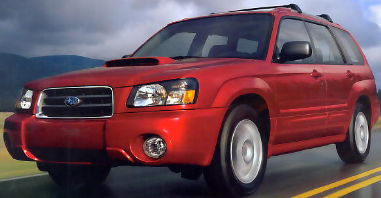
Forester 2.5 XT with Premium Package shown in Ceyenne Red Pearl