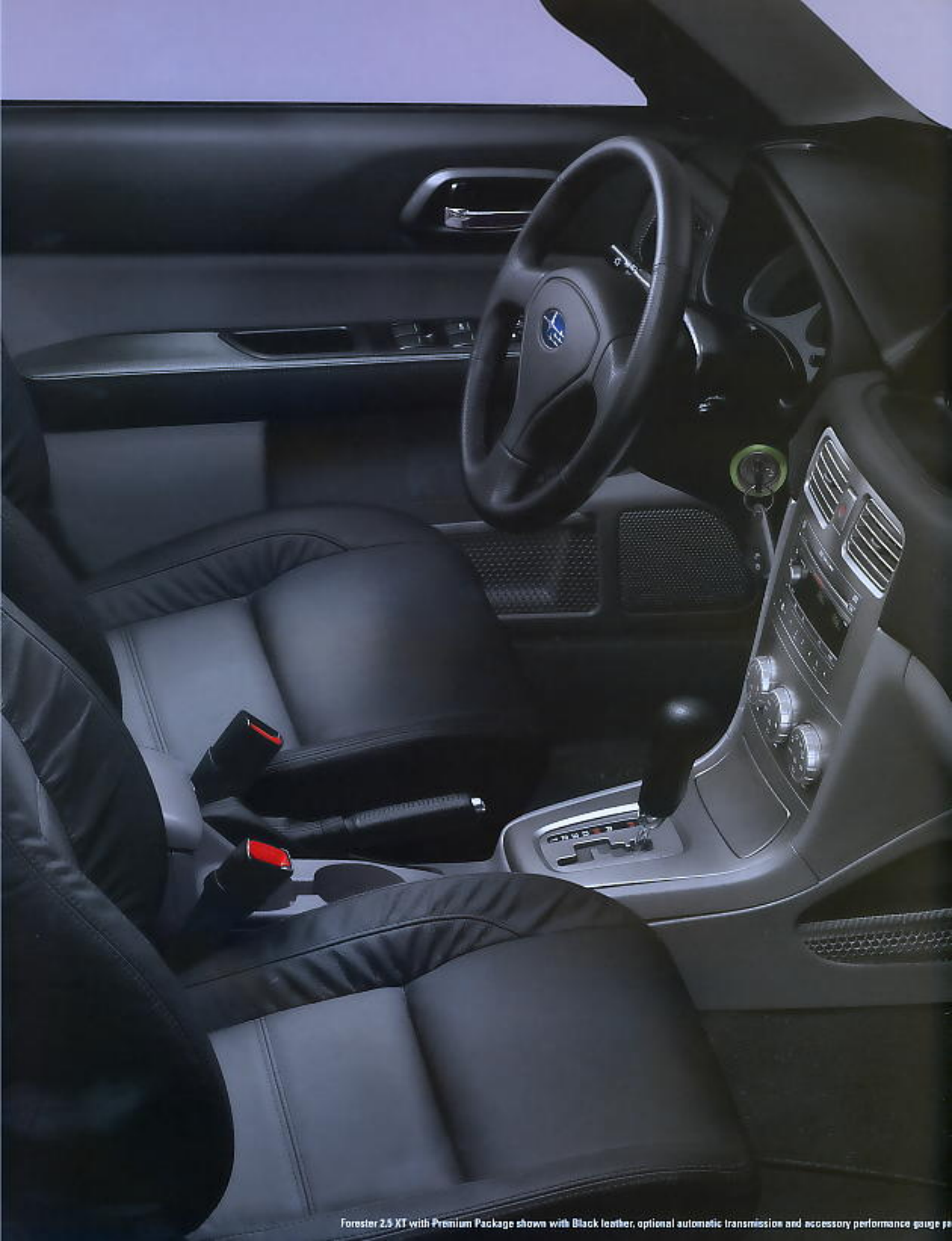
Forester 2.5 XT with Premium Package shown with Black leather, optional automatic transmission and accessory performance gauge package.