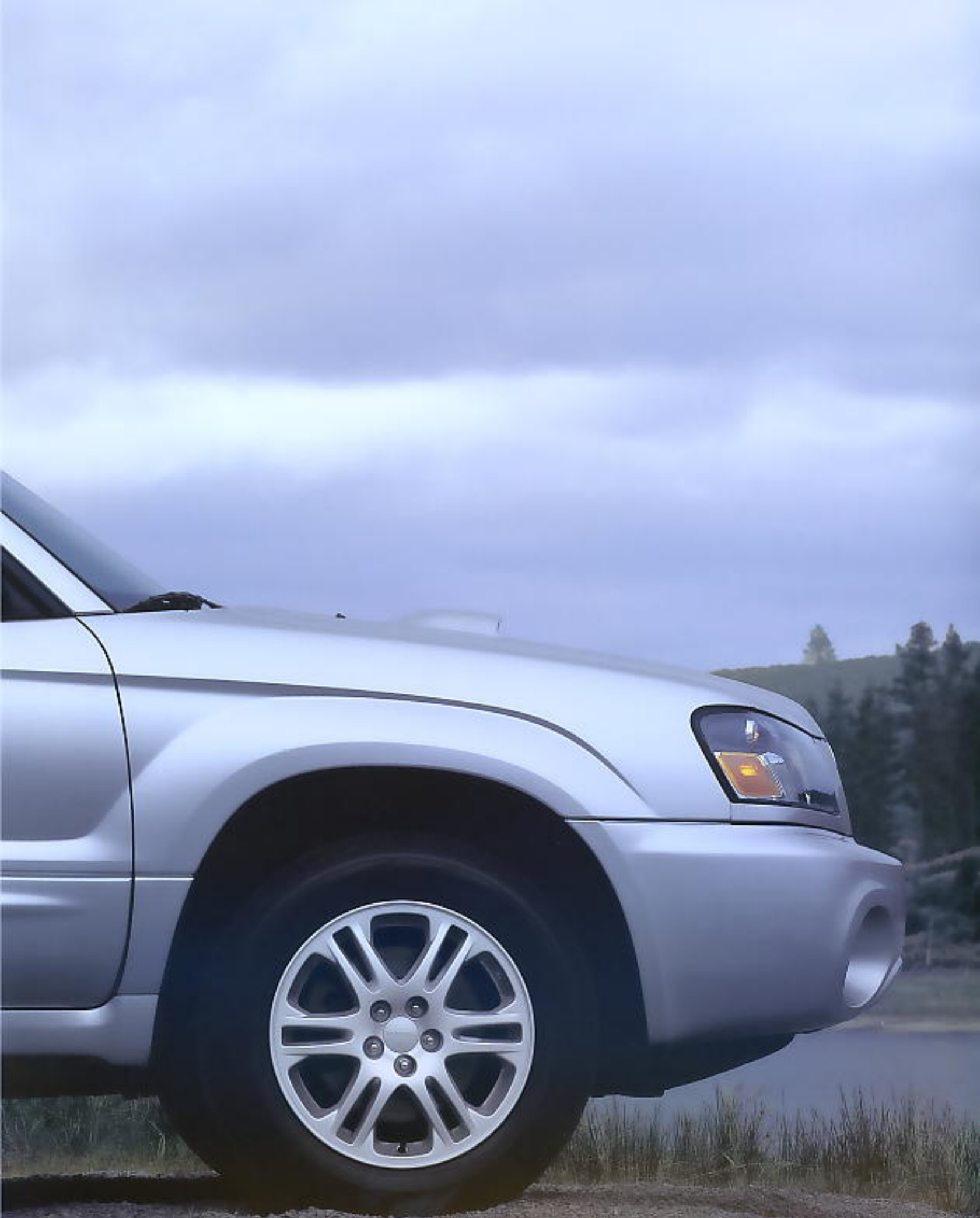
Forester 2.5 XT with Premium Package shown in Platinum Silver Metallic with accessory heavy-duty cargo basket