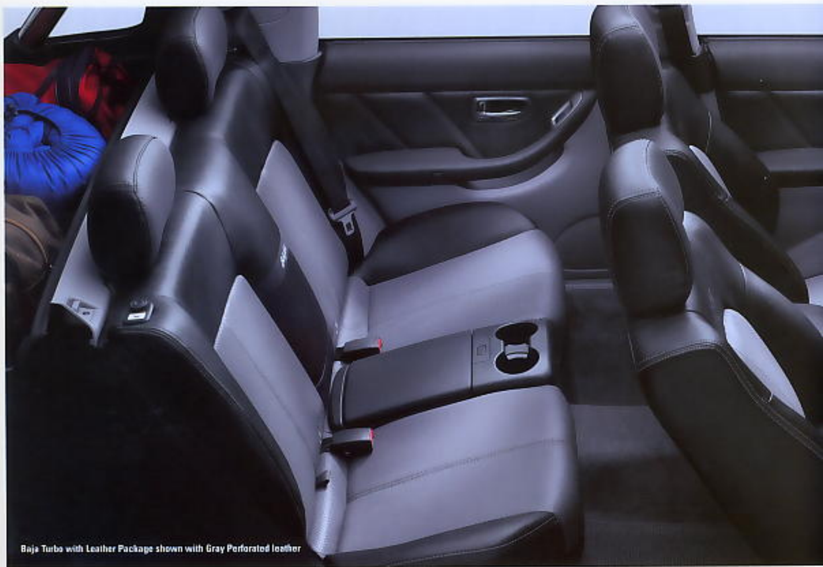
Baja Turbo with Leather Package shown with Gray Perforated leather