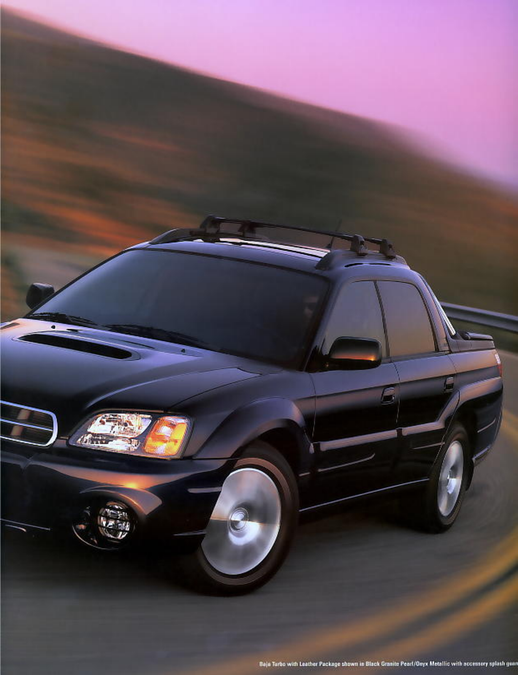
Baja Turbo with Leather Package shown in Black Granite Pearl/Onyx Metallic with accessory splash guard